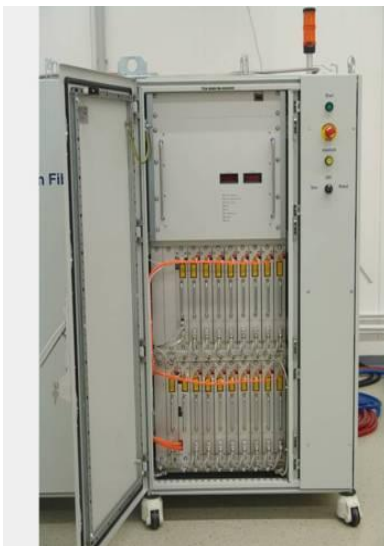
Figure 1 : Industrial solution of a multi-mode fiber laser.