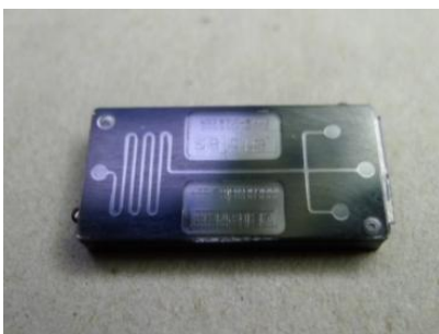
Figure 2: Precise polymer welding by laser mask welding technique

During laser mask welding technique, an incident laser line is scanned along a mask, transmitting a weld structure on a work piece. The weld accuracy of this method strongly depends on the optical quality of the incident laser beam, on the pattern precision of the applied mask and on the precision of the mask alignment relative to the polymer parts. The new developed system (Fig. 1) consists of an optical processing head generating a well-collimated and homogeneous laser line and a precise mask alignment system. Moreover, the implemented mask technology is designed for high-power laser application.